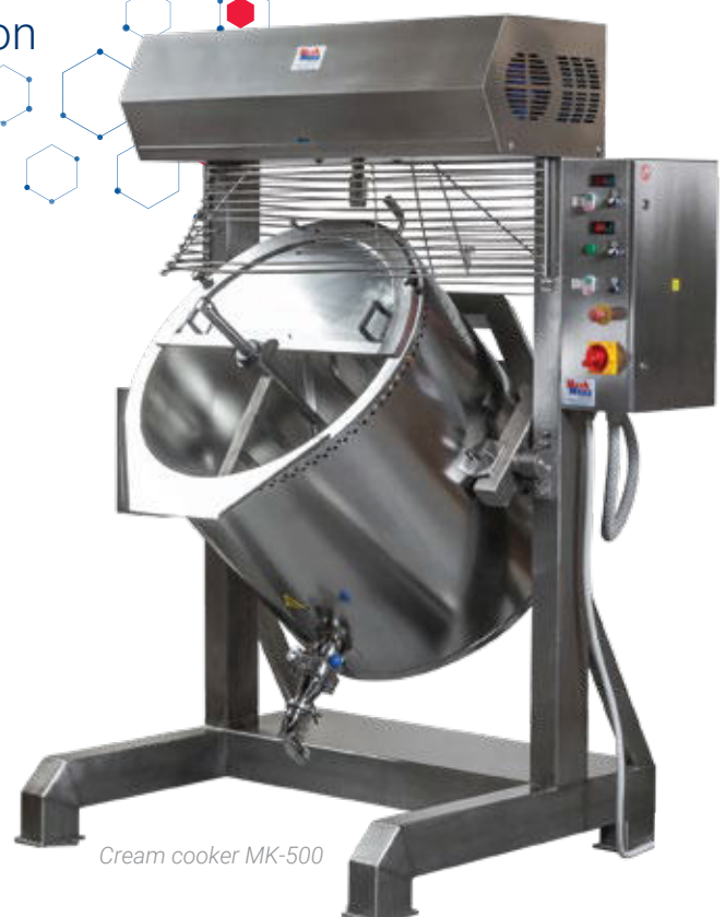
Cream cooker MK-500